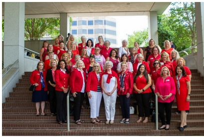
Women from NCFRW found the Legislative Day in Raleigh to be instructive - and fun!

Here is a small sampling of photos from the meeting: