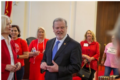
Senator Phil Berger, President Pro Tempore in the Senate chamber.